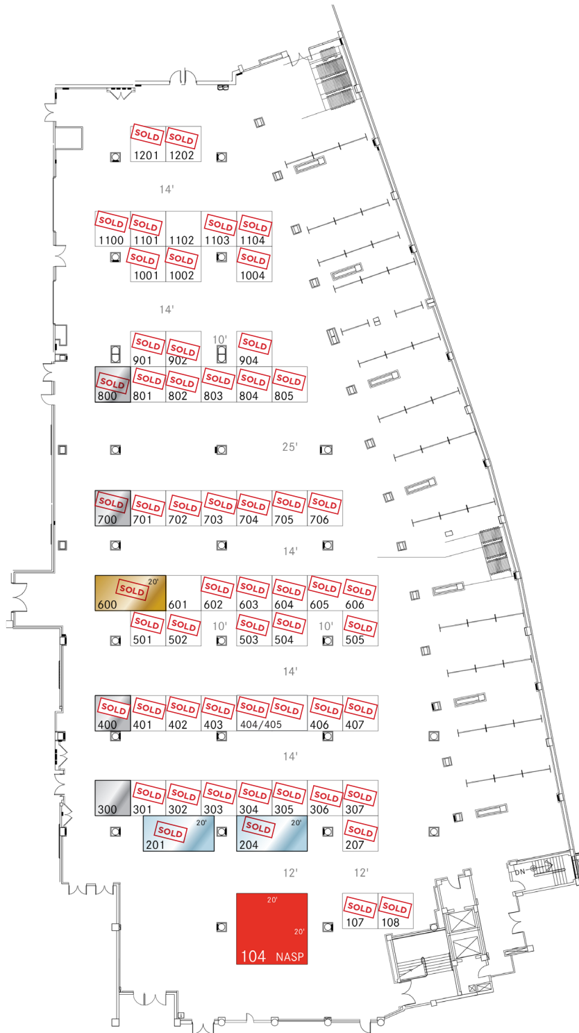
EXHIBIT FLOOR PLAN