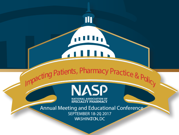
Exhibit Dates: September 18-20, 2017 Washington Marriott Wardman Park, Washington, DC

Impacting Patients, Pharmacy Practice & Policy